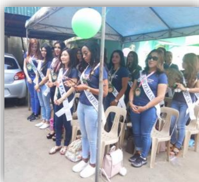
Mrs. Tourism International