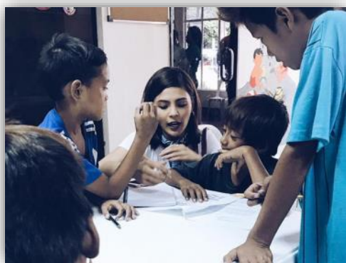
Ms. Lovi Poe