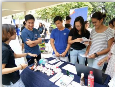
TUKLAS Advocacy Fair